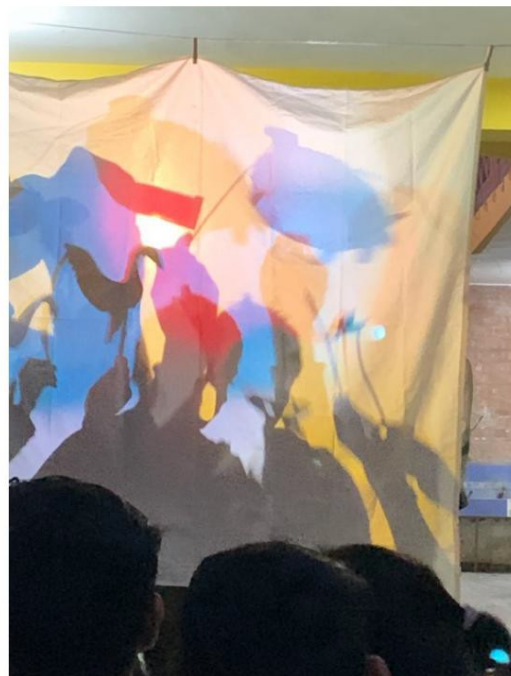
The shadow puppet show